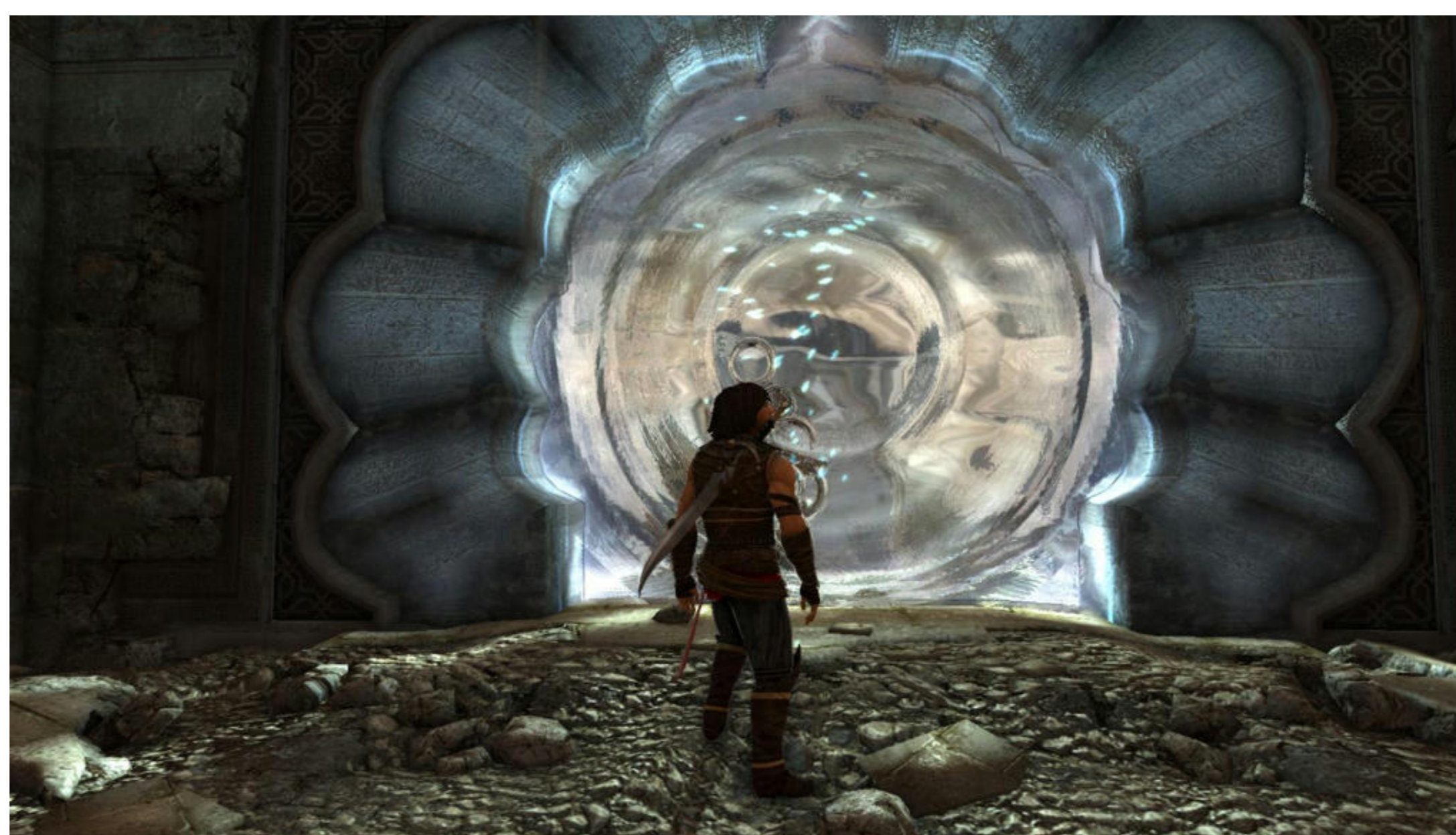
Prince of Persia: The Forgotten Sands Crackfix Repack SKIDROW Torrent